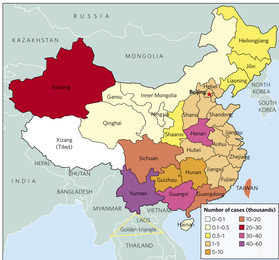
Figure 1 | Pervasive spread. The geographic distribution of cumulative reported HIV-1 infection in mainland China (redrawn from ref. 4).

Located in southwest China, Yunnan has long been regarded as China's Shangri-la for its natural beauty. But now, with all of its 16 prefectures affected, it is a major site of